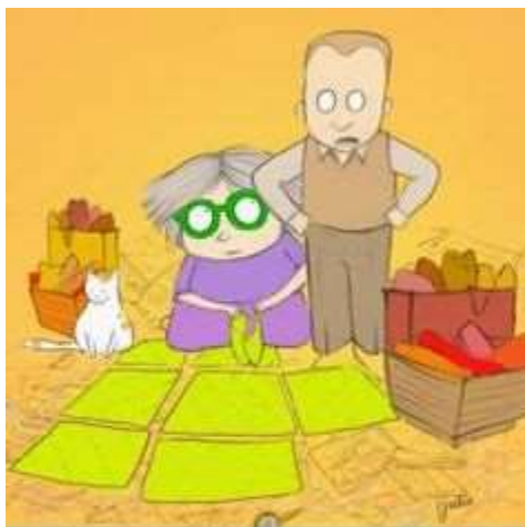
"Laying out a quilt top over the mess doesn't count as spring cleaning."

Have a little company while you work on your project in the comfort of your own home. See what fellow Westside Quilters are working on and get a glimpse of their working space. This is a FREE event. Zoom links are sent to all members. Members join in discussing various topics and ask questions, usually quilting related.